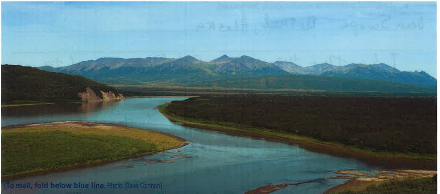
(To mail, fold below blue line.)