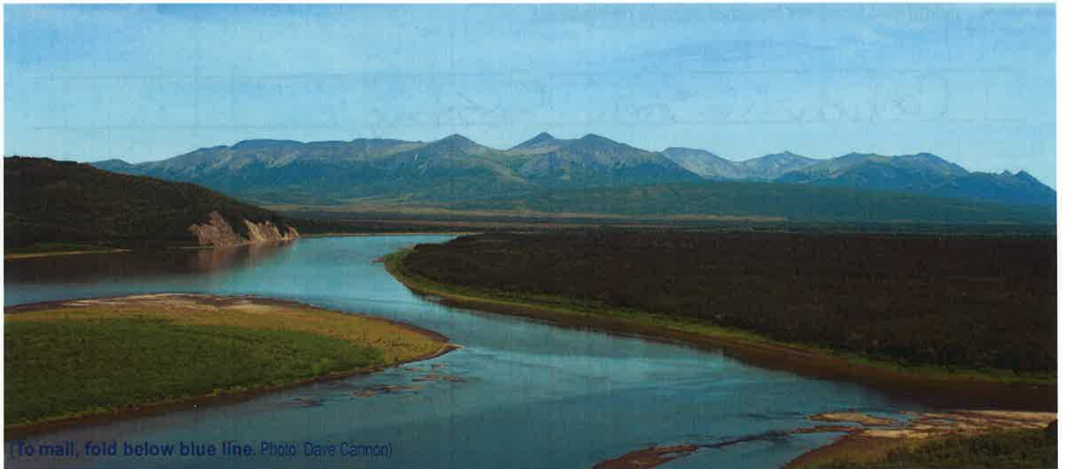
(To mail, fold below blue line.)