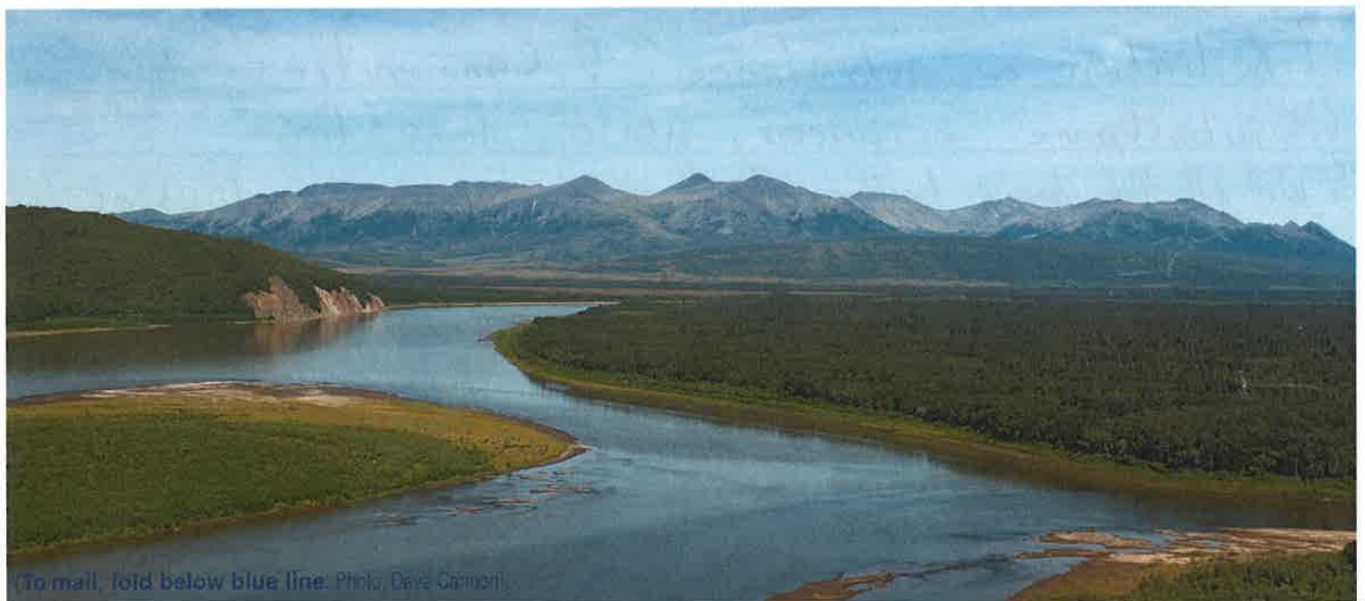
(To mail, fold below blue line.)