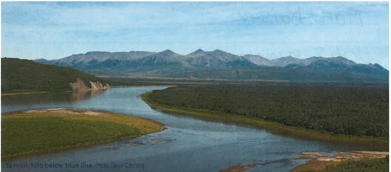
(To mail, fold below blue line.)