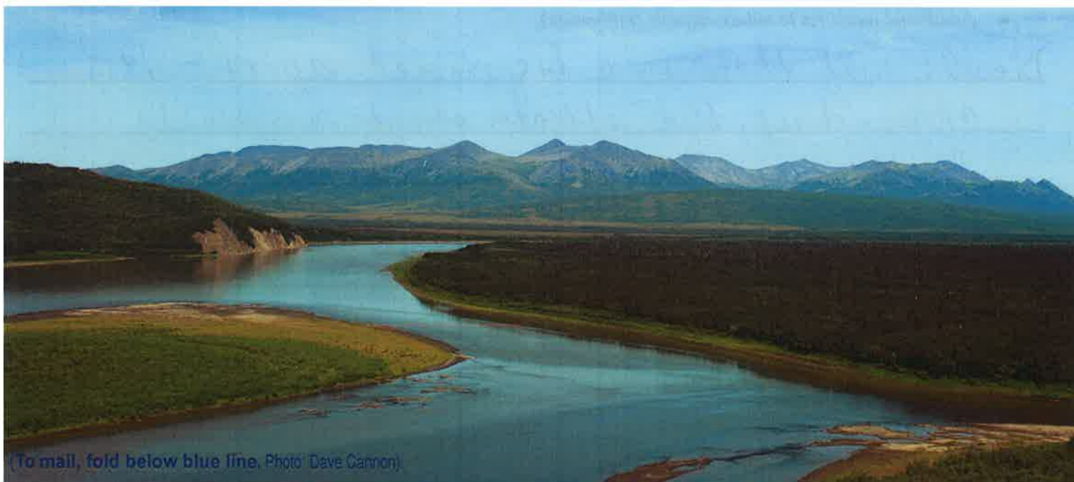
(To mail, fold below blue line.)