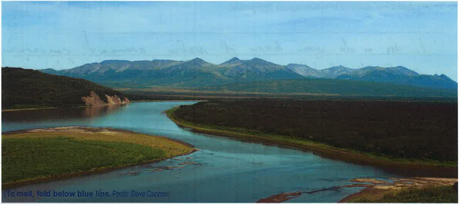
(To mail, fold below blue line.)