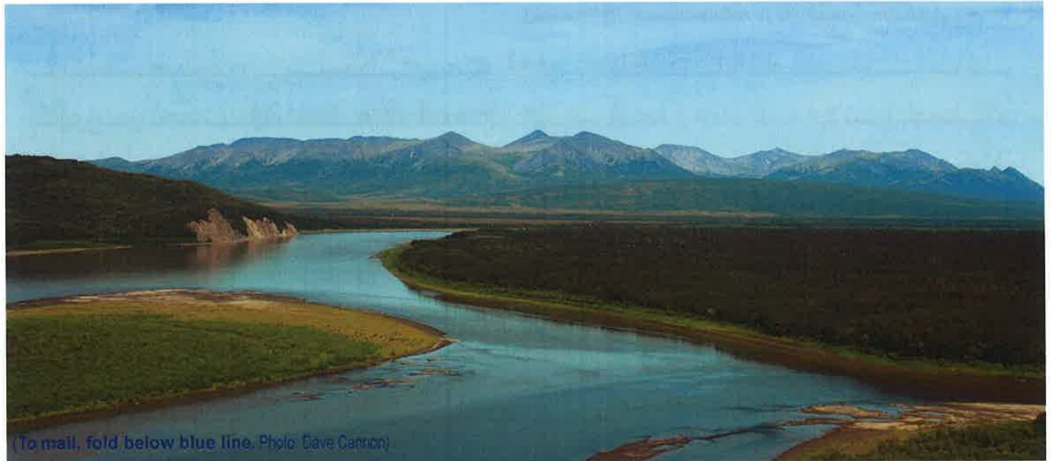
(To mail, fold below blue line.)