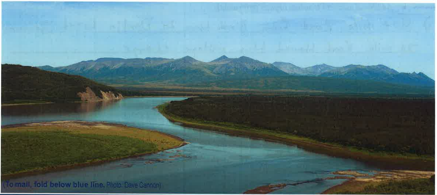
(To mail, fold below blue line.)