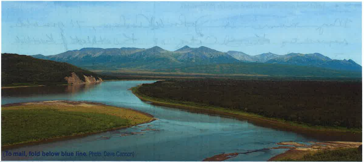
(To mail, fold below blue line.)