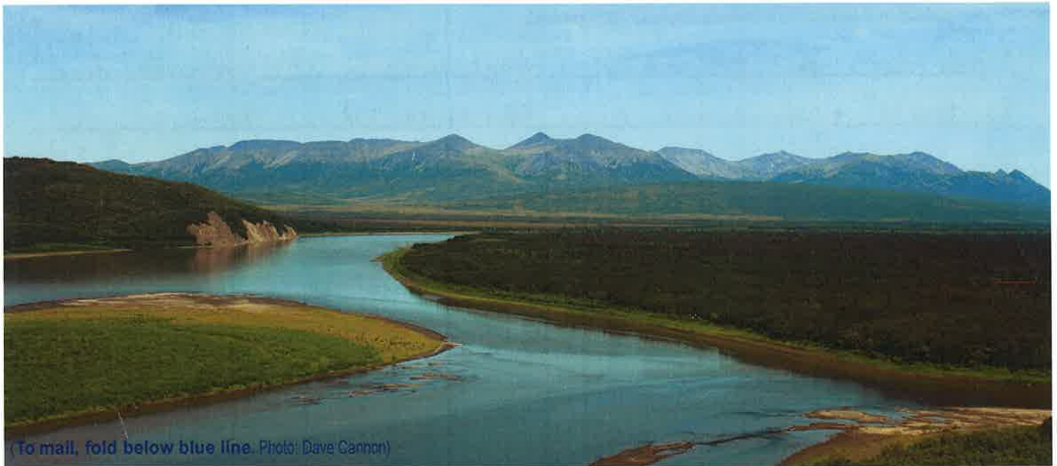
(To mail, fold below blue line.)